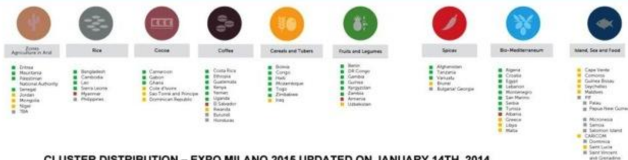
CLUSTER DISTRIBUTION – EXPO MILANO 2015 UPDATED ON JANUARY 14TH, 2014