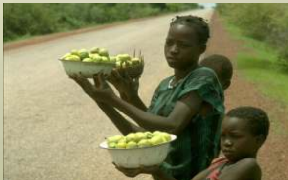
A showcase of African forestry and wildlife sector